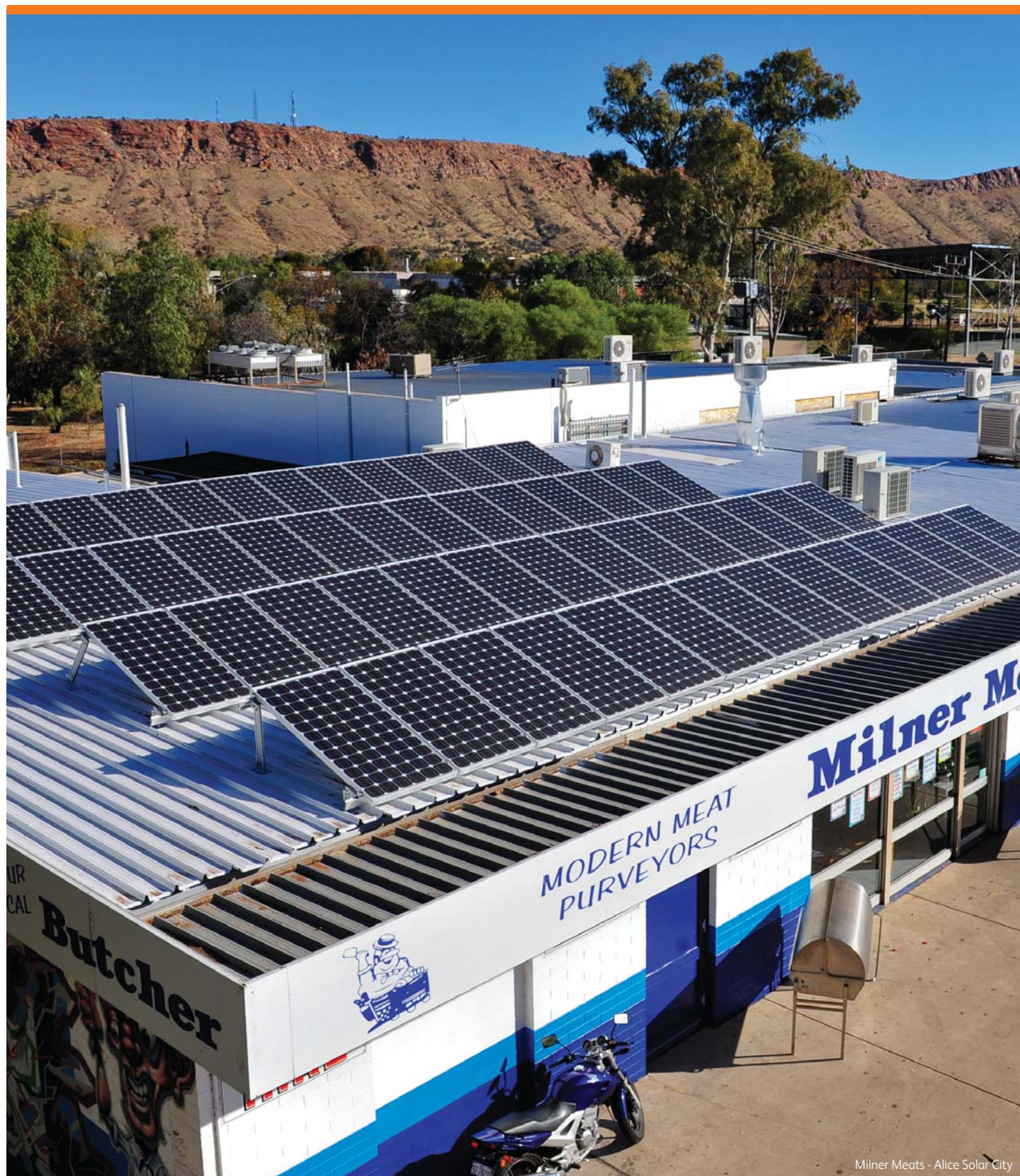
Milner Meats - Alice Solar City